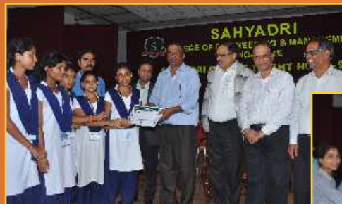
First Place - SSPU College Subrahmanya