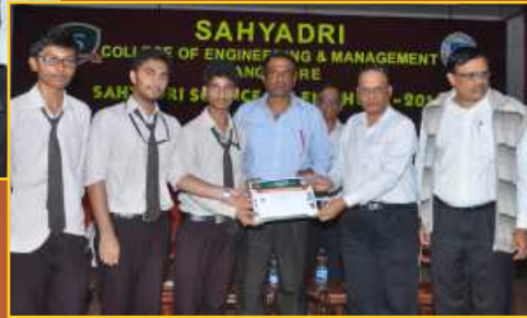
Third Place - Mahesh PU College Mangaluru