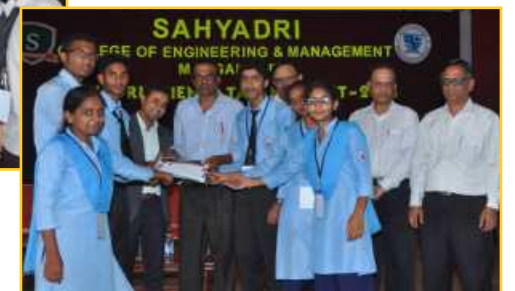
Third Place - MPMES INDP PU College Bhadravathi