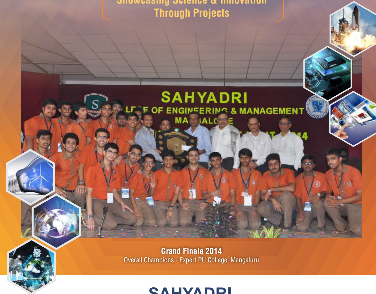
Grand Finale 2014 Overall Champions - Expert PU College, Mangaluru

Official contact +91 94481 00000 | Email: ssth@sahyadri.edu.in | Web: sahyadri.edu.in/SSTH