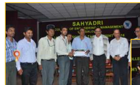
Third Place - DVS PU College Shimoga