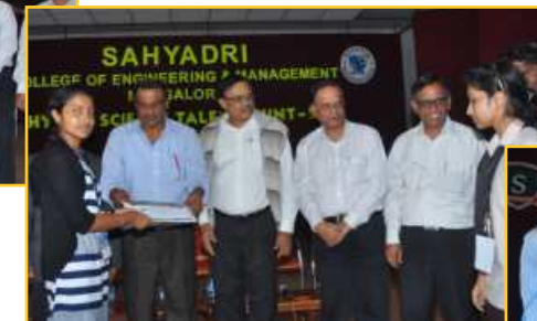
Second Place - GHSS, Hosdurg Kasargod