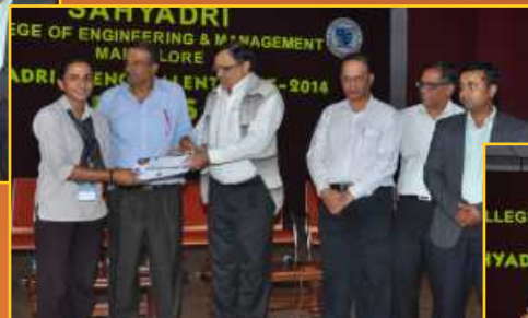
Second Place - Mahesh PU College Mangaluru