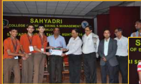
First Place - Expert PU College Mangaluru