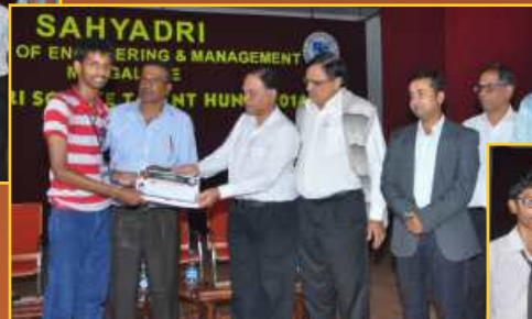
Second Place - Govindas PU College Mangaluru