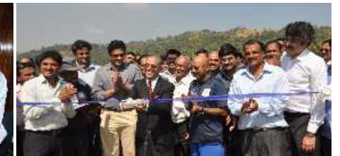
Inauguration of KSCA Cricket Academy by Mr. Anil Kumble and Mr. Javagal Srinath