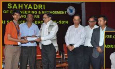
First Place - Expert PU College Mangaluru