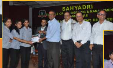
Second Place - Sahyadri PU College Mangaluru