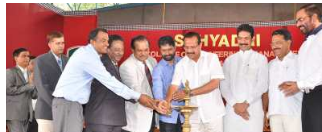
The Government Research Center, Incubation Center, Placement and Training Center Inaugurated by the then Hon'ble Chief Minister of Karnataka