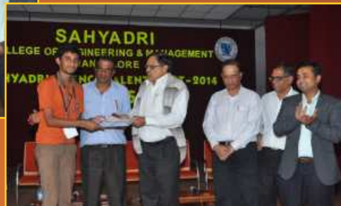
Third Place - Expert PU College Mangaluru