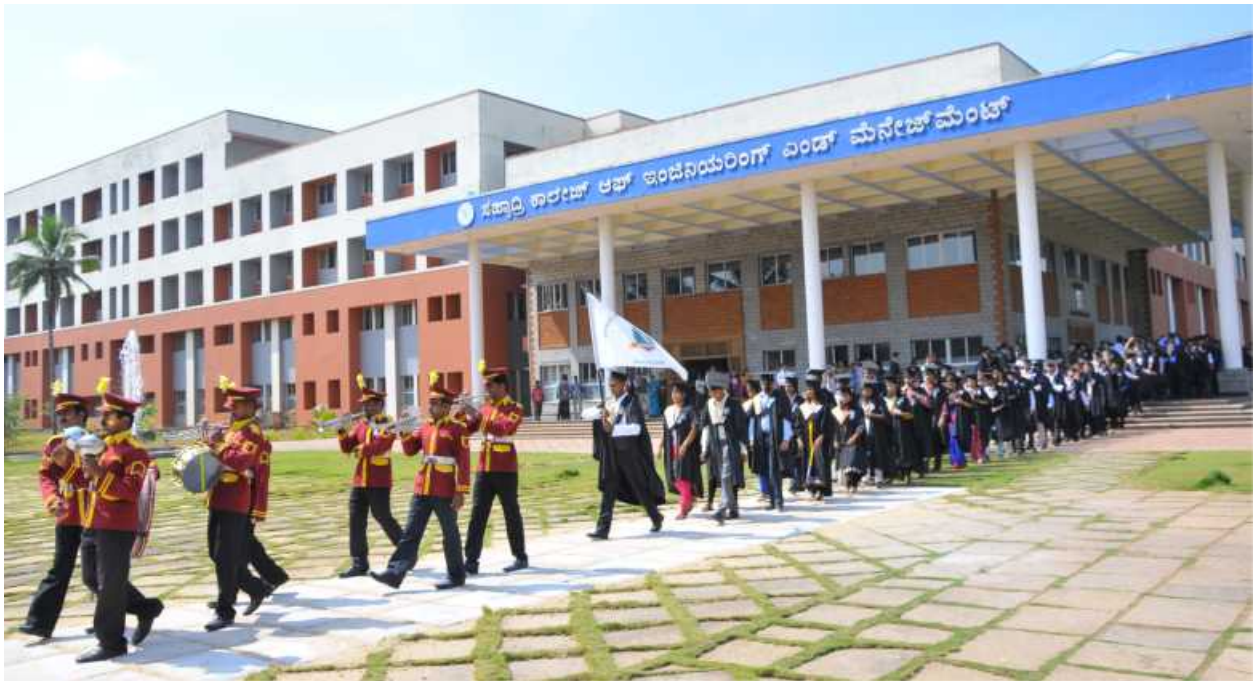
March Past of the Students to the Venue