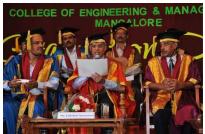
The Chief Guest declares the students as graduates

Time now to welcome the graduates to be. I am really proud and privileged to welcome you all to this third graduation day of Sahyadri College of Engineering & Management which is also the most important day of your life. Let me also bless you and wish you all the best in all your future endeavours. I would also like to welcome the proud parents of our graduates to be, to this function. Now, I would heartily welcome all the students of Sahyadri to this important function. Welcome, welcome one and all, Thank you.