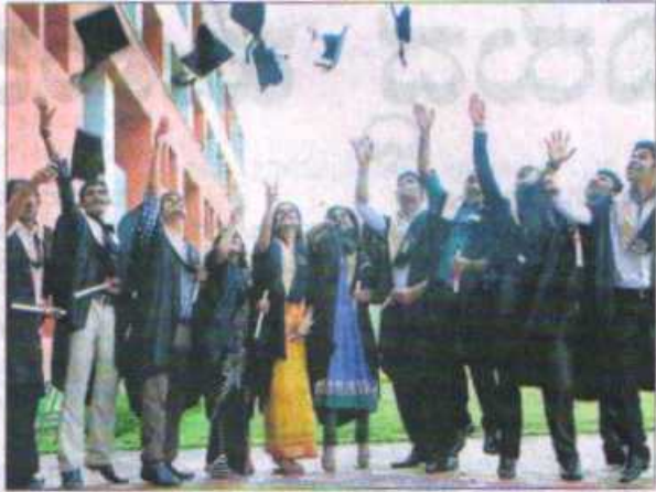
ಮಂಗಳೂರಿನ ಆಡ್ವಾನ್ಸೆಡ್ ಸಹ್ಯಾದ್ರಿ ಎಂಜಿನಿಯರಿಂಗ್ ಮತ್ತು ಉದ್ಯಮಾಡಳಿತ ಕಾಲೇಜಿನಲ್ಲಿ ಗುರುವಾರ ಪದವಿ ಸ್ವೀಕರಿಸಿದ ವಿದ್ಯಾರ್ಥಿಗಳ ಸಂಭ್ರಮ.

'ತಂತ್ರಜ್ಞಾನಗಳ ಆವಿಷ್ಕಾರದಿಂದ ಎಲ್ಲಾ ಕ್ಷೇತ್ರಗಳಲ್ಲೂ ಮಹತ್ತರ ಬದಲಾವಣೆಗಳಾಗಿವೆ. ಬಯೋಟೆಕ್ನಾಲಜಿ ವ್ಯಾಸಂಗ ಮಾಡಿದ ವಿದ್ಯಾರ್ಥಿ ಶಸ್ತ್ರಚಿಕಿತ್ಸಾ ಕೊಠಡಿಯಲ್ಲಿ ಮಿದುಳಿಗೆ ಮೈಕ್ರೋಚಿಪ್ ಅಳವಡಿಸಲು ನೆರವಾಗುವ ಕಾಲಘಟ್ಟ ಇದು. ನೀವು