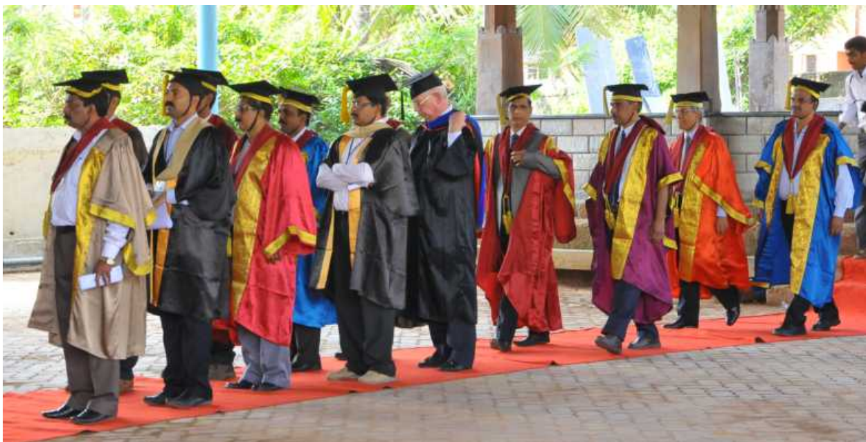
March Past of the Dignitaries