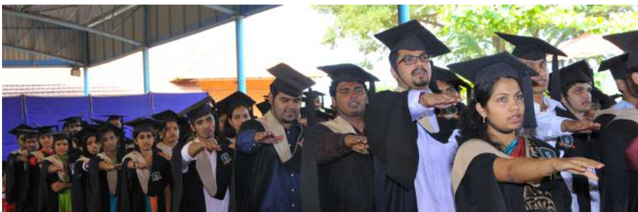
Graduates taking the Oath