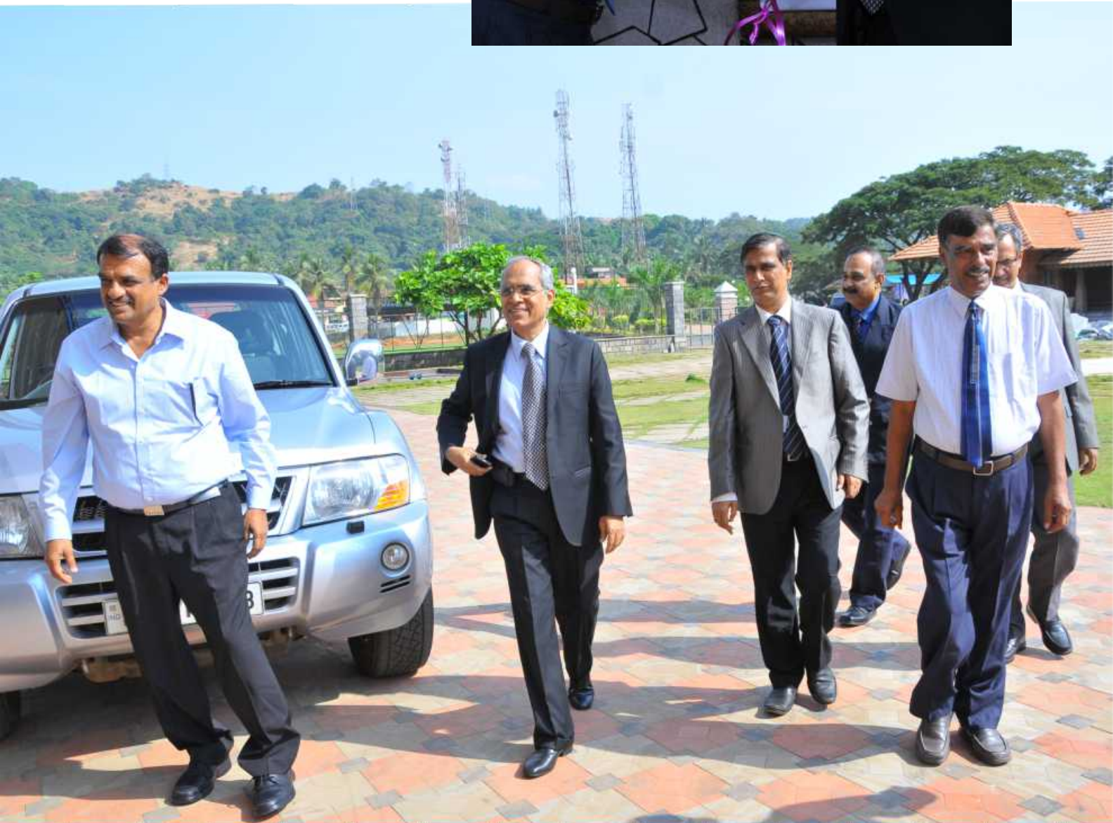
Stepping into Sahyadri Campus