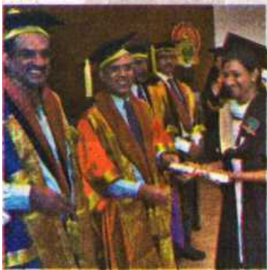
ವಿದ್ಯಾರ್ಥಿಗಳಿಗೆ ಪದವಿ ಪ್ರದಾನಿಸಲಾಯಿತು.