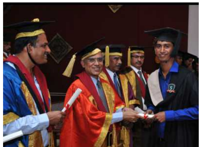
Students receiving their Provisional Degree Certificates

“ I hope this void can be filled by collaborating with high profile industries like Cognizant and other multi-national strong heads. ”