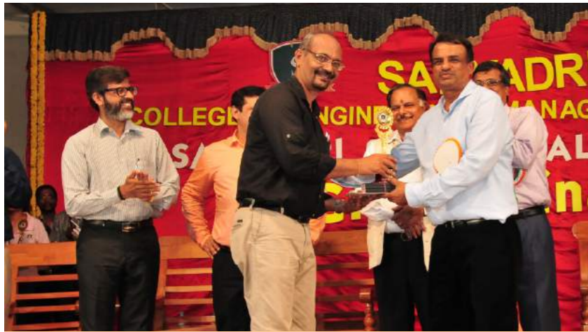
I Place - Expert PU College, Valachil