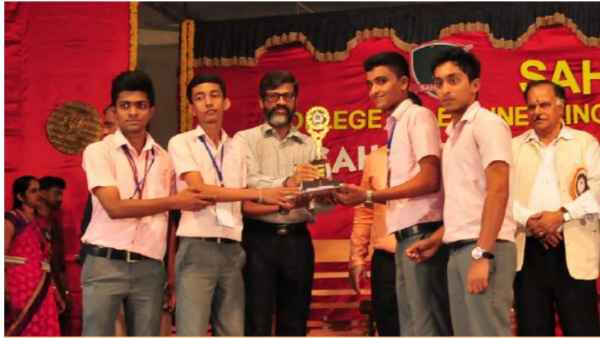
I Place - St. Philomina PU College, Puttur