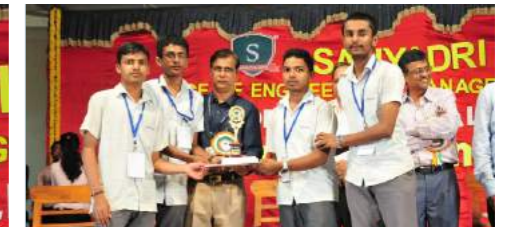
II Place - SDM PU College, Ujire