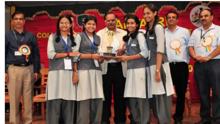
I Place - Canara Girls High School, Mangaluru