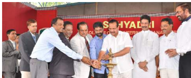
The Government Research Center, Incubation Center, Placement and Training Center Inaugurated by the then Hon'ble Chief Minister of Karnataka