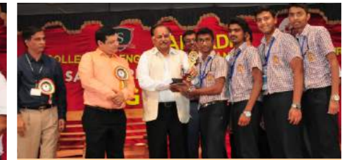
II Place - Excellent High School, Moodbidri