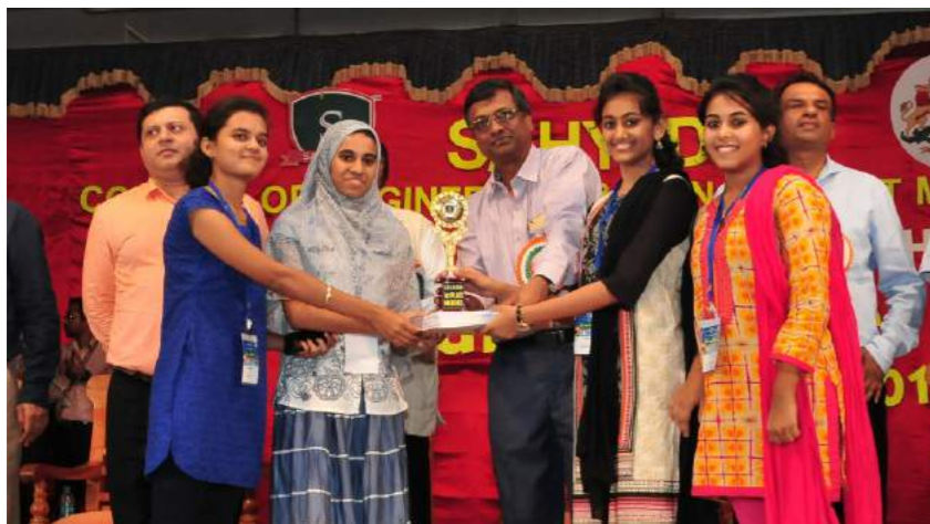
I Place - M G M PU College, Udupi