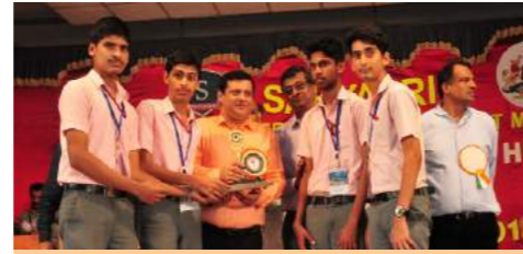
II Place - St. Philomina PU College, Puttur