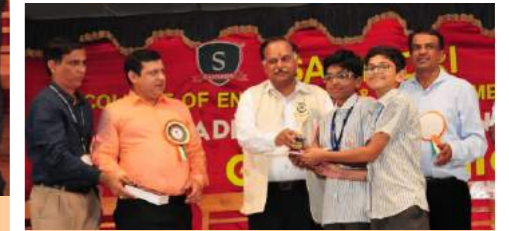
III Place - Yenepoya High School, Mangaluru