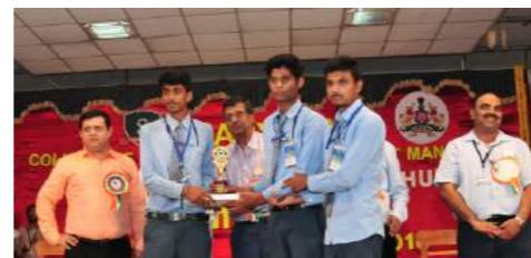
II Place - B.G.S PU College, Chikkamagaluru