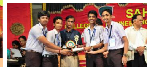
III Place - Vani PU College, Belthangady