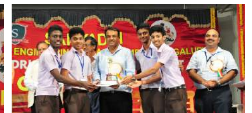
II Place - Excellent PU College, Sunnari