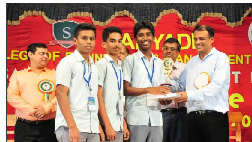
I Place -Viveka PU College, Kota