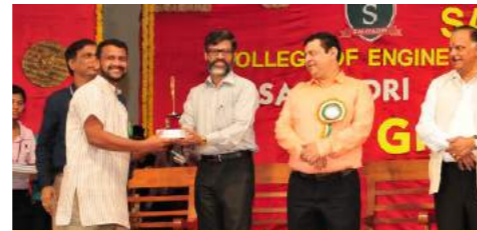
II Place - Expert PU College, Kodialbail