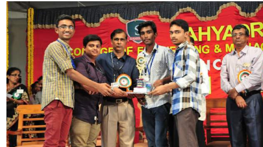
I Place -Sri Rama PU College, Kalladka