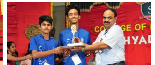
III Place - St. Aloysius PU College, Mangaluru