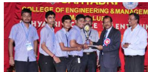
III Place - Pana PU College, Mangaluru