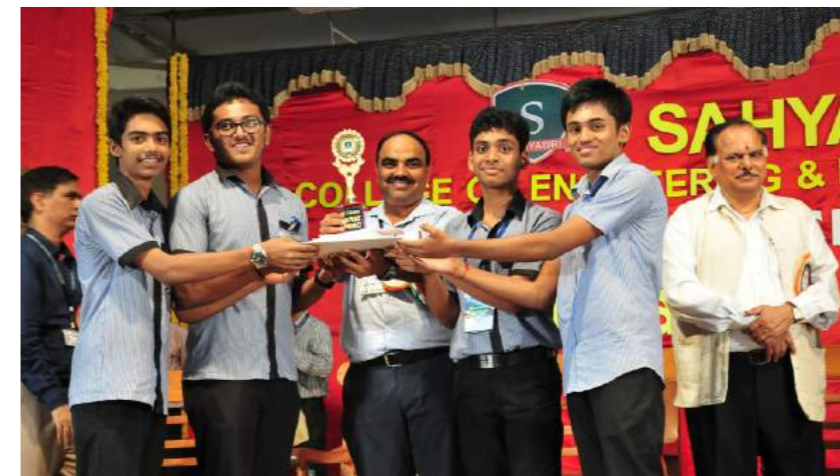
I Place - Sharada PU College, Mangaluru