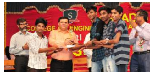
III Place - Govindadasa PU College, Surathkal