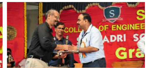
II Place - Expert PU College, Valachil