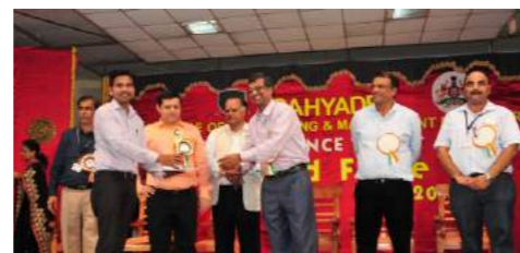
III Place - Excellent PU College, Haladi