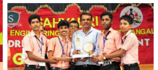
III Place - Trisha PU College, Kallianpur, Udupi