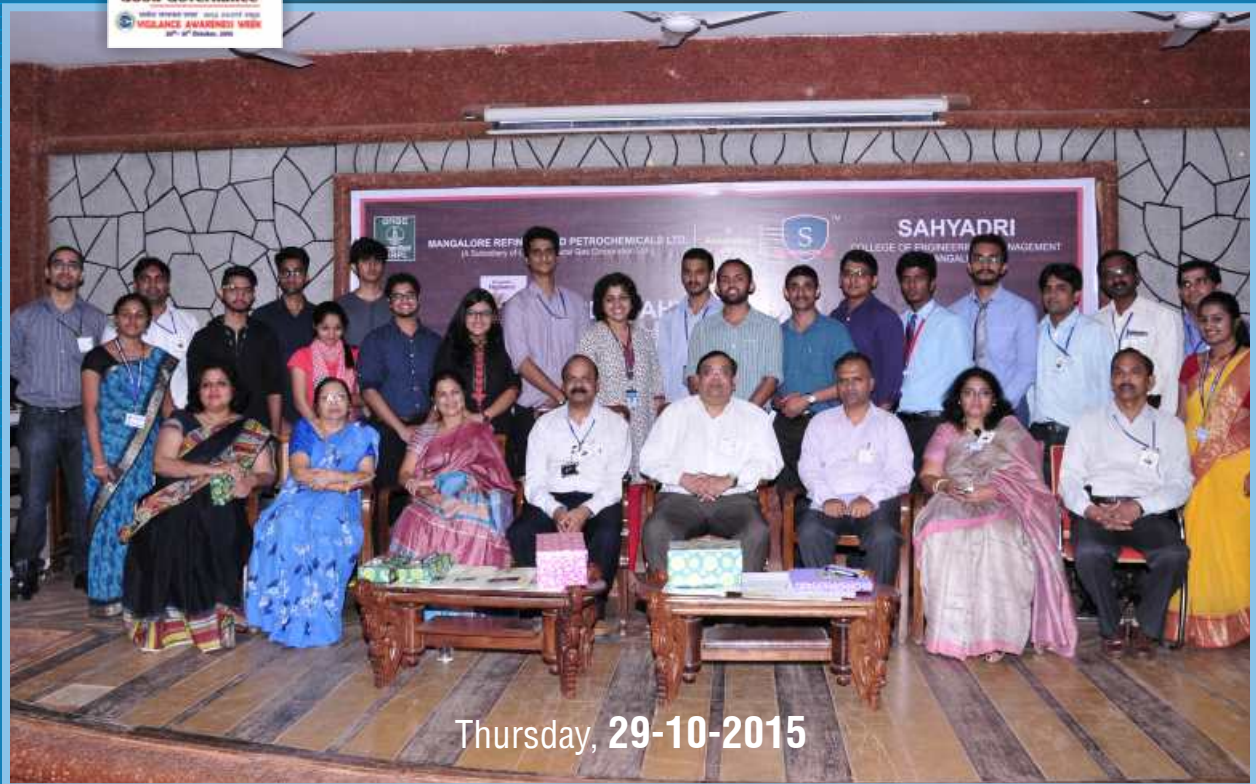
Winners and Judges with members of MRPL and Sahyadri

Inter Professional Collegiate Debate Competition 2015