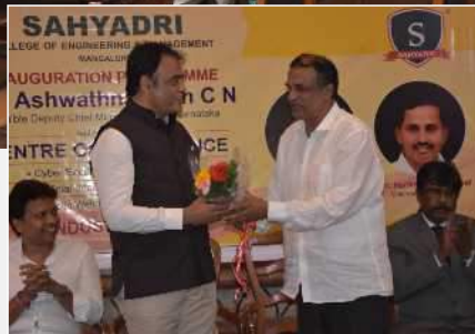
Dr. C N Ashwathnaraya Deputy Chief Minister, Govt. of Karnataka