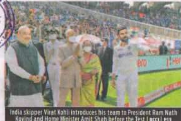
India skipper Virat Kohli introduces his team to President Ram Nath Kovind and Home Minister Amit Shah before the Test 1 in Lucknow