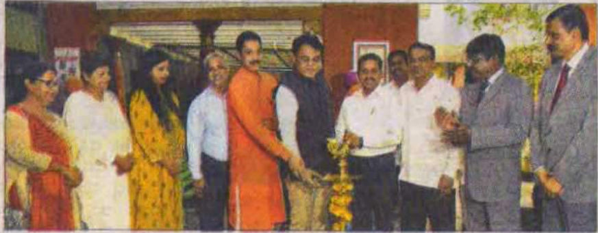
ಡಾ| ಅಶ್ವತ್ಥ ನಾರಾಯಣ ಅವರು ಉದ್ಘಾಟನೆಯ ಅಂಗವಾಗಿ ದೀಪ ಬೆಳಗಿಸಿದರು.

ಶಿಕ್ಷಣ ಸಂಸ್ಥೆ ಮತ್ತು ಕೈಗಾರಿಕೆ ಸಹ ಕಾರ, ಇಂಟರ್ ನೆಟ್‌ನಲ್ಲಿ ಸಮಗ್ರ ಬದಲಾವಣೆ ಮಾಡಲಾಗುವುದು. ರಾಷ್ಟ್ರೀಯ ಶಿಕ್ಷಣ ನೀತಿ ಜಾರಿಗೊಳಿಸುವುದರಿಂದ ಎಂಜಿನಿಯರಿಂಗ್ ಕಾಲೇಜುಗಳು ಎದುರಿಸುತ್ತಿರುವ ಸಮಸ್ಯೆಗಳಿಗೆ ಪರಿಹಾರ ಸಿಗಲಿದೆ