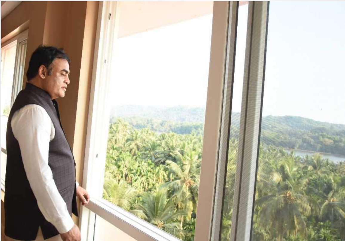
Netravati River view from the TCE office