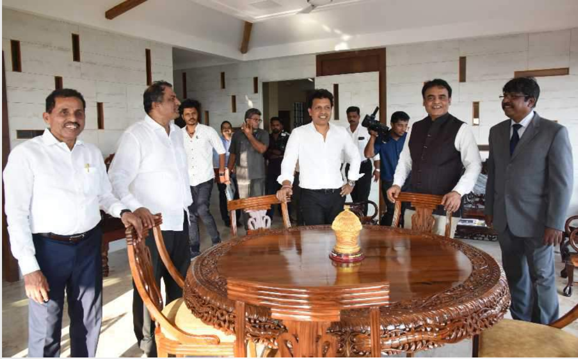
Dignitaries at the TCE Office