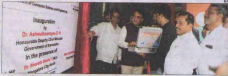
ಅಡ್ಡಾರ್ ಸಹ್ಯಾದ್ರಿ ಕಾಲೇಜಿನಲ್ಲಿ ಇಂಡಸ್ಟ್ರಿ ಹಬ್ ಉದ್ಘಾಟಿಸಿದ ಡಾ.ಅಶ್ವತ್ಥನಾರಾಯಣ.

ವಿ.ಟಿ.ಯುನಲ್ಲಿ ನಿರ್ದಿಹೊಂದನ್ನು ಸ್ಥಾಪಿಸಿ ಸ್ಟಾರ್ಟ್ ಅಪ್‌ಗೆ ಉತ್ತೇಜನ ನೀಡಲಾಗುವುದು. ಈ ವರ್ಷ ಸ್ಟಾರ್ಟ್ ಅಪ್ ಸ್ಥಾಪಿಸಲು 50 ಕೋಟಿ ರು. ತೆಗೆದಿರಲಾಗಿದೆ. ಶಿಕ್ಷಣ ಸಂಸ್ಥೆ ಮತ್ತು ಕೈಗಾರಿಕೆ ಸಹಕಾರ, ಇಂಟರ್‌ನ್‌ಶಿಪ್‌ನಲ್ಲಿ ಸಮಗ್ರ ಬದಲಾವಣೆ