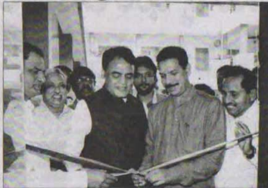
ಇಂಡಸ್ಟ್ರೀಸ್ ಹಬ್‌ನ್ನು ಡಿ.ಸಿ.ಎಂ. ಡಾ.ಸಿ.ಎನ್. ಅಶ್ವತ್ಥನಾರಾಯಣ್ ಉದ್ಘಾಟಿಸಿದರು. ಎನ್.ಎಮ್.ಎನ್. ಕೆ-ಟಿ ಸೆಂಟರ್‌ನ ಹೊಸ ಕಾರ್ಯಾಲಯವನ್ನು ಸಂಸದ ನಳಿನ್ ಕುಮಾರ್ ಕಟೀಲು ಉದ್ಘಾಟಿಸಿದರು. ಸೆಂಟರ್ ಆಫ್ ಎಕ್ಸಲೆನ್ಸ್ ಇನ್ ಡಿಜಿಟಲ್ ಫಾರ್ಮ್ಸ್ ಇನ್ ಇಂಟಿಲಿಜೆನ್ಸ್ ಆಂಡ್ ಸೈಬರ್ ಸೆಕ್ಯೂರಿಟಿ ಮತ್ತು ಇಂಡಸ್ಟ್ರೀಸ್ ಹಬ್ ಉದ್ಘಾಟಿಸಿದರು. ಶಾಸಕ ವೇದವ್ಯಾಸ ಕಾಮತ್ ಸೆಂಟರ್ ಆಫ್ ಎಕ್ಸಲೆನ್ಸ್ ಇನ್ ಆರ್ಕಿಟೆಕ್ಚರ್ ಇಂಟಿಲಿಜೆನ್ಸ್ ಆಂಡ್ ಸೈಬರ್ ಸೆಕ್ಯೂರಿಟಿ ಮತ್ತು ಇಂಡಸ್ಟ್ರೀಸ್ ಹಬ್ ಉದ್ಘಾಟಿಸಿದರು.

ಪ್ರಪಂಚವನ್ನೇ ಬದಲಾಯಿಸುವಷ್ಟು ಪ್ರತಿಭೆ ಕರ್ನಾಟಕದಲ್ಲಿದೆ. ಪ್ರತಿವರ್ಷ 8 ಲಕ್ಷ ಉದ್ಯೋಗ ಸೃಷ್ಟಿಯಾಗುತ್ತಿದ್ದು, 5 ಲಕ್ಷ ಪದವೀಧರರು ಹೊರಬರುತ್ತಿದ್ದಾರೆಂದು.