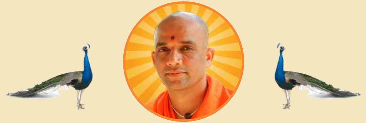
Sri Sri Sri Nirmalanandanatha Swamiji Sri Adichunchanagiri Maha Samsthana Math