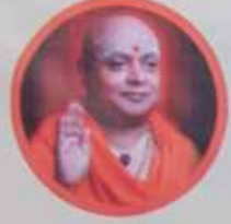
His Holiness Paramapoojya Jagadguru Padmabhushana Sri Sri Sri Dr. Balagangadaranatha Swamiji