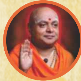
Paramapoojya Jagadguru Padmabhushana Sri Sri Sri Dr. Balagangadaranatha Swamiji