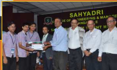
Third Place - Excellent PU College Mangaluru