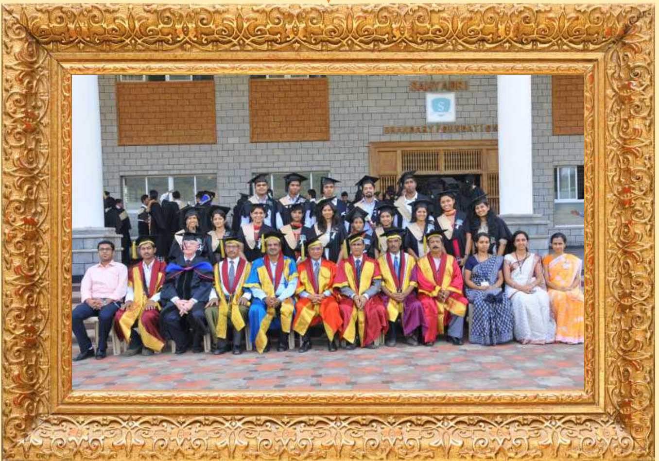
Graduation Day - Department of Information Science Engineering - VIII SEM - 28-11-2013