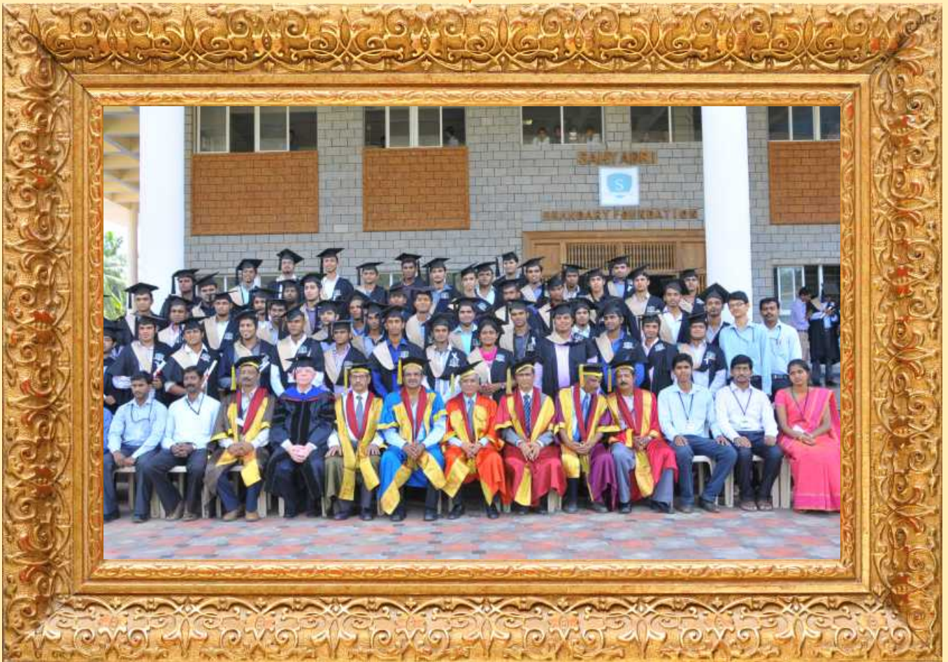
Graduation Day - DEPARTMENT OF MECHANICAL ENGINEERING - VIII SEM - 28-11-2013