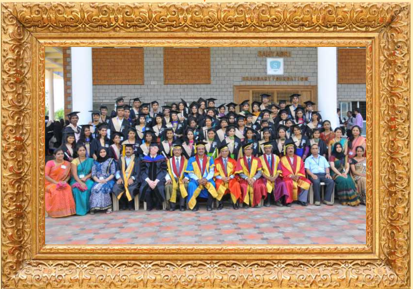
Graduation Day - Department of Computer Science- VIII SEM - 28-11-2013